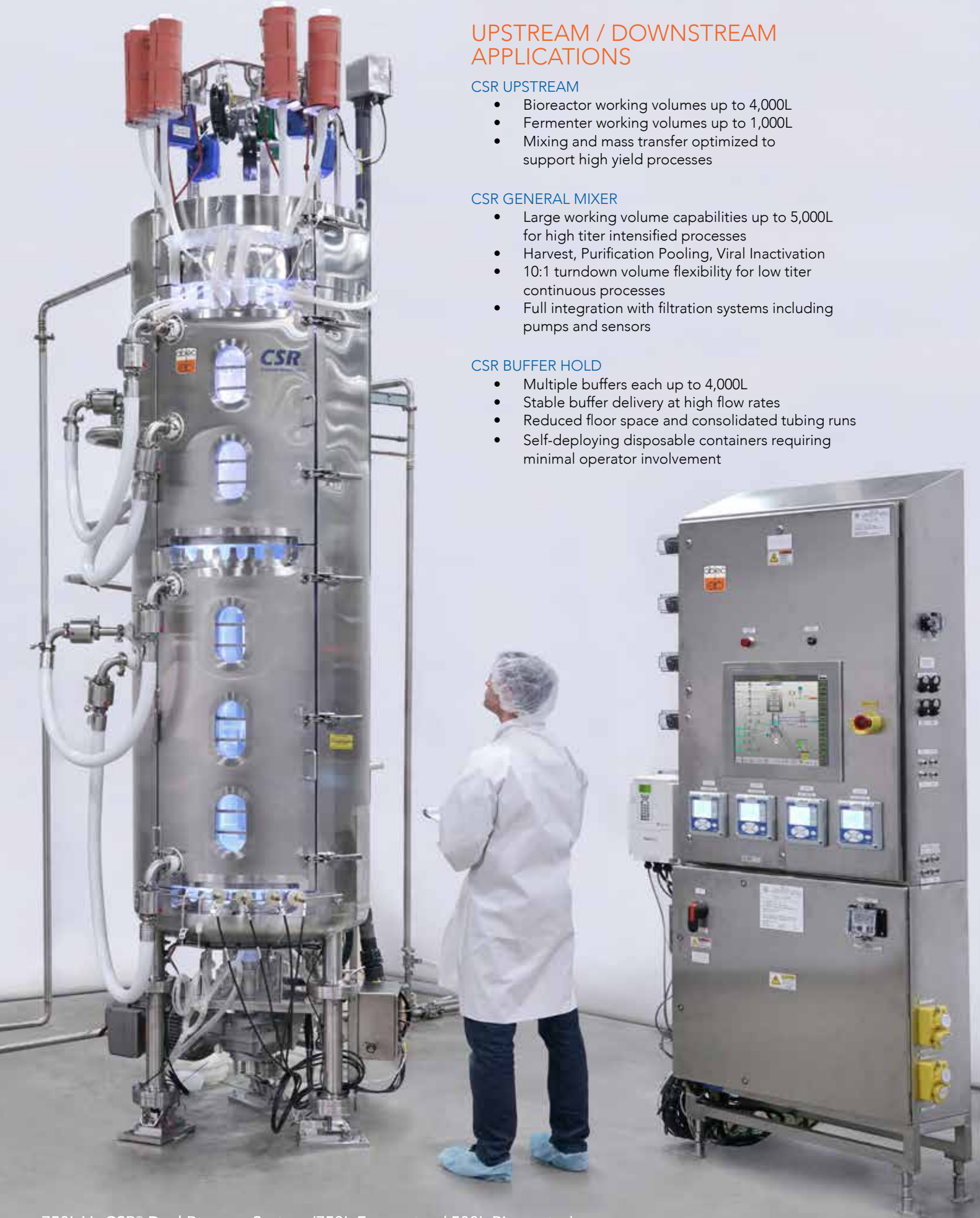
750L V w CSR® Dual Purpose System (750L Fermenter / 500L Bioreactor)