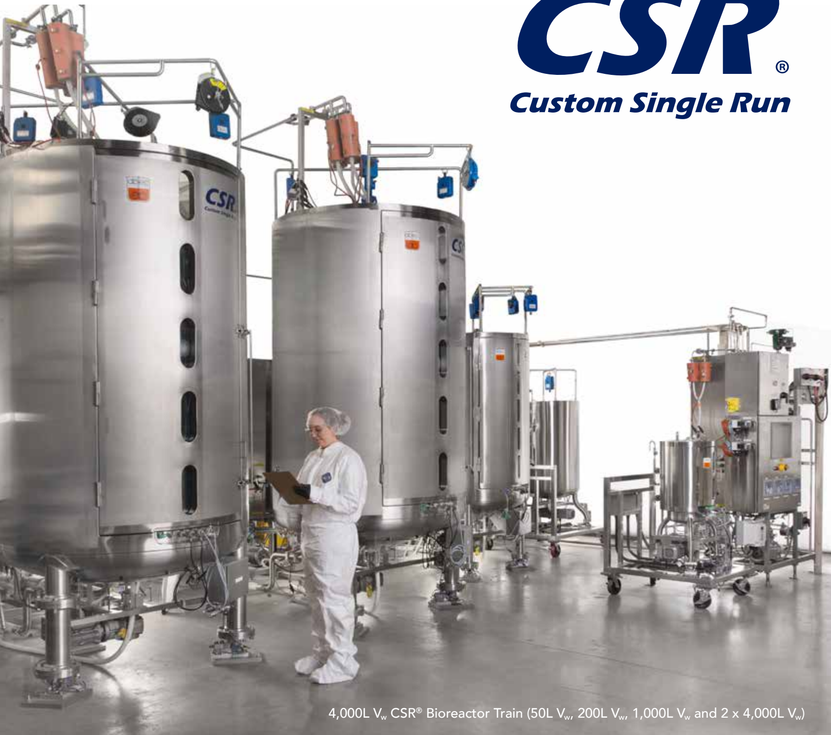
4,000L V w CSR ® Bioreactor Train (50L V w , 200L V w , 1,000L V w and 2 x 4,000L V w )

Since 1974, ABEC has been a leader in delivering integrated process solutions and services for manufacturing in the biopharmaceutical industry. The majority of the world's pharmaceutical and biotech companies are ABEC customers; with many of today's leading therapies manufactured by processes and equipment engineered, manufactured, installed and serviced by ABEC.